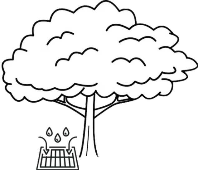
Additional Outdoor Area

You are welcome to fill out additional forms for as many areas you notice have litter