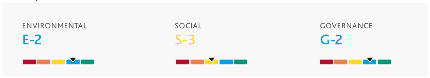
Exhibit 5 ESG issuer profile scores

Philadelphia School District's ESG Credit Impact Score of CIS-2 reflects the limited impact that environmental, social and governance risks have on the district's credit rating.